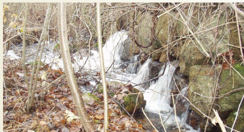
This image was taken in 2006 at Blue Pond Dam (#229) in Hopkinton. The dam failed during the March/April 2010 flood.

FEMA Independent Study Program: http://training.fema.gov/IS/