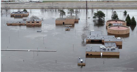
2010 RI Floods