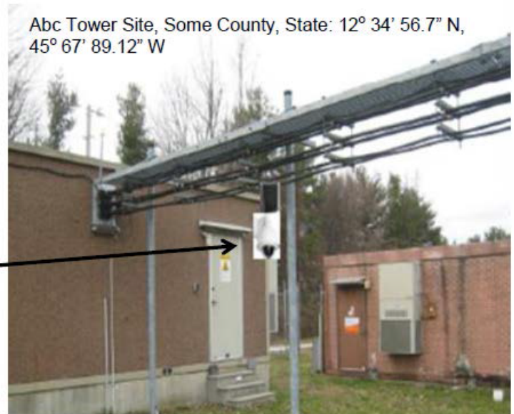
Figure 3. Ground-level photograph with graphic showing proposed equipment installation.

Ground-level photograph with excavation area close-up. The example in Figure 4 shows the proposed location for the concrete pad for a generator and the ground disturbance to connect the generator to the building's electrical service. This information can be illustrated with either an aerial or ground-level photograph, or both. This example has the name and physical address of the project site.