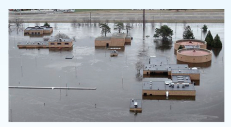
2010 RI Floods